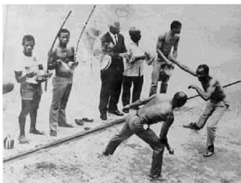
Berimbau played in Capoeira

Elements from the set, designed by Rachana Jadhav are an important feature of the show's aesthetic and it takes its inspirations from the work of the Bahiano painter Carybé and the iconic photos of Pierre Verger, the French anthropologist. Screens on wheels will constantly move to create the different spaces where the action takes place and will also serve as support for the projection of shadows representing, amongst other things, Dona's sexual desires and the Orixás . As in previous Dende shows, we will experiment with the clash between art forms from different parts of the globe.