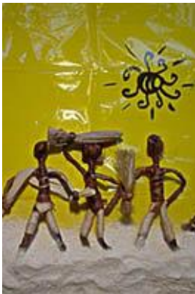
Agreste - 2005