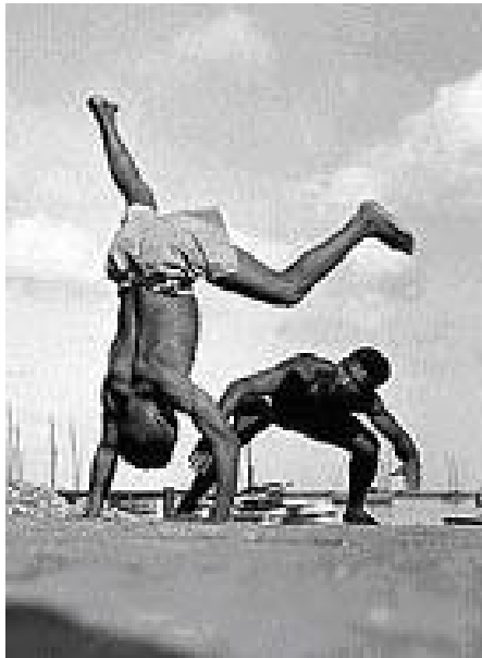
Capoeiristas

One rebellion however was successful. A group of 40 slaves rose up and killed their master, burning his house and plantations. Helped by the native Indians, they then went to hide in the mountains and settled in an area they called Palmares.