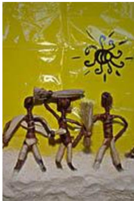
Agreste - 2005