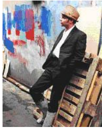
Two Lost Souls on a dirty night