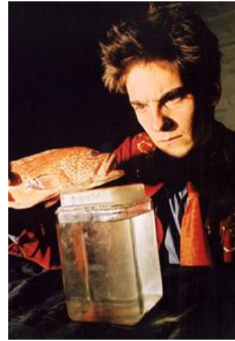
The Piranha Lounge

THE PIRANHA LOUNGE was based on stories by Murilo Rubião, the first Brazilian writer of the genre Magic Realism (see page 4). The play transformed a small studio theatre into a seedy after-hours club where audience members met the strange characters of Rubião's stories. It premiered at the Oval House Theatre in December 2002. The show was then invited for another three-week run at the Oval where it performed to packed houses and received Time Out Critics' Choice. It was also performed at The Lyric Studio in March 2004.